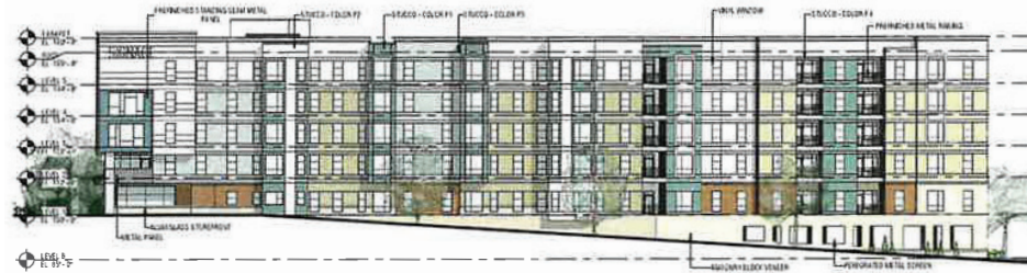
2 SOUTH ELEVATION - W 87TH ST. PKWY 1/4" = 1'-0"