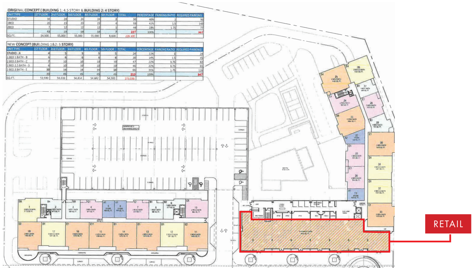
LEVEL 1 -- RETAIL OVERALL PLAN